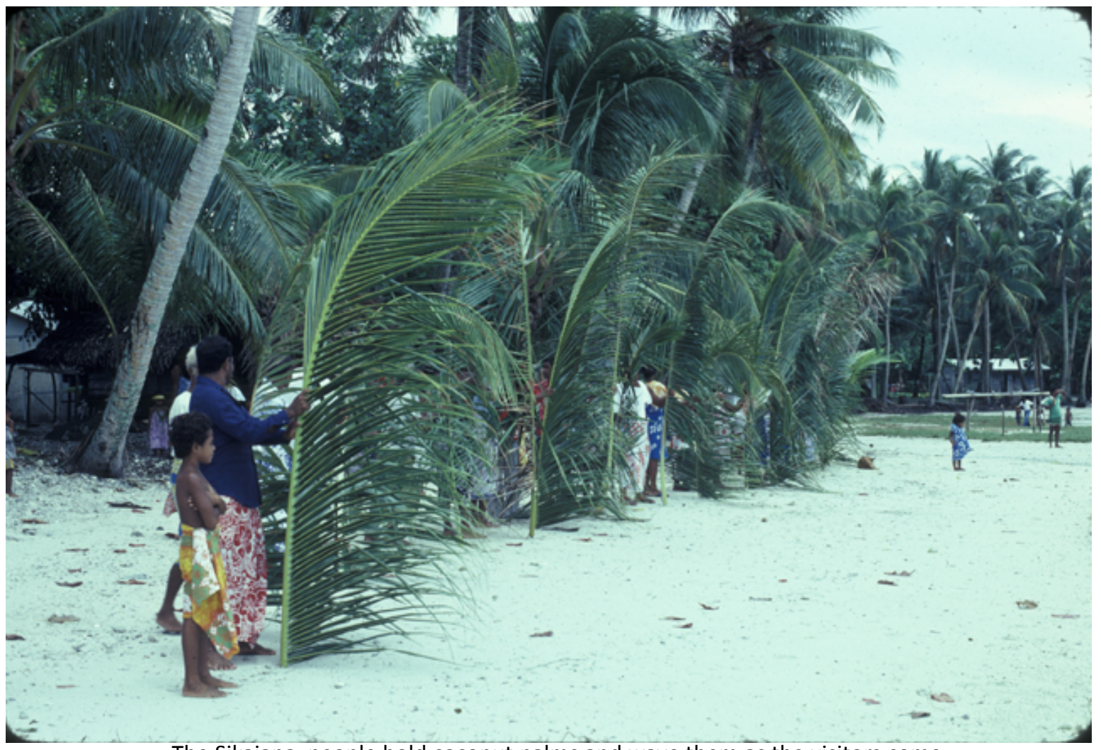
The Sikaiana people hold coconut palms and wave them as the visitors come ashore. I was told that in the traditional Teika Llee this was done to placate a large animal that had washed up on the reef.