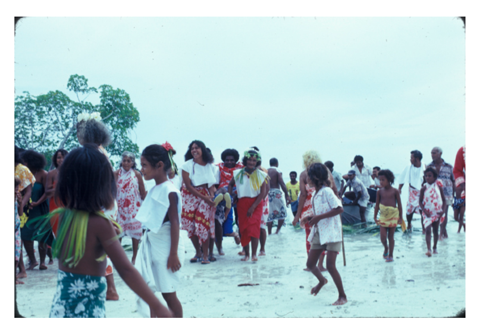
Prime Minister is carried ashore.