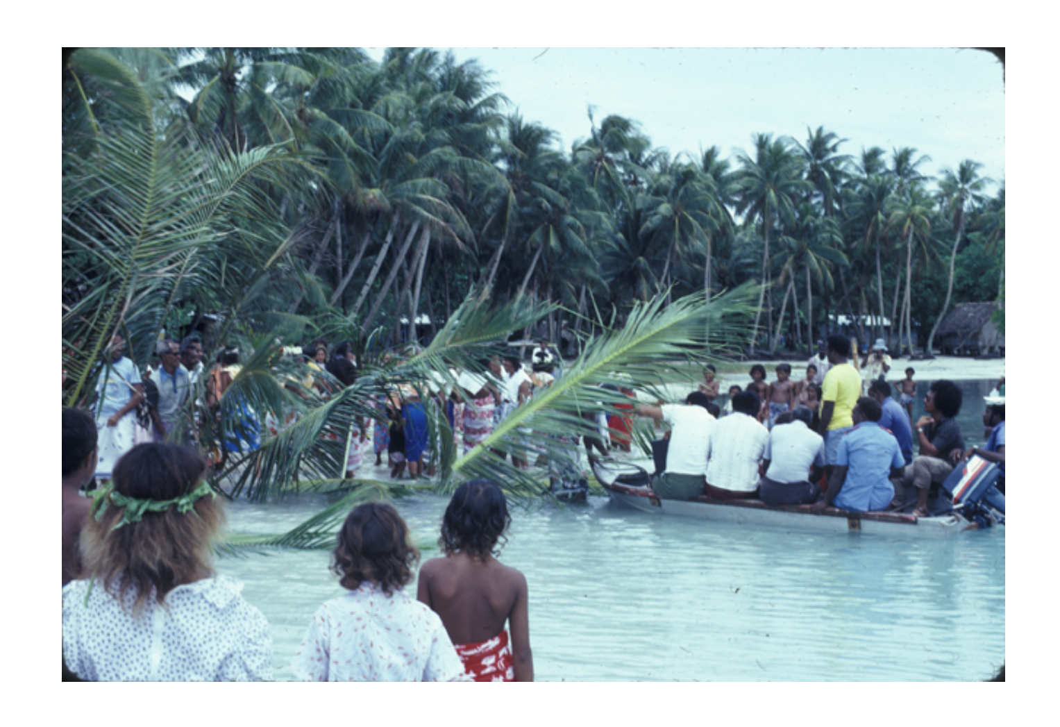
The Prime Minister comes ashore.